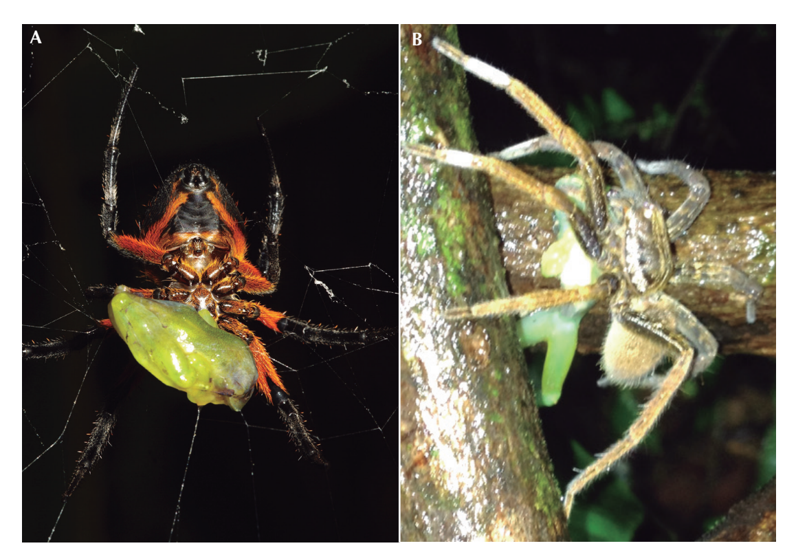
Figure 1. Predation on Teratohyla spinosa (A) by Eriophora sp. at Tirimbina Biological Reserve and (B) Ancylometes bogotensis at La Selva Biological Station, both in Costa Rica.

The animals were first observed at about 1830 hr (Figure 3); when we returned to the location 4.5 hr later, more than one third of the frog had been consumed by the spider. To our knowledge this is the first published observation of predation on Duellmanohyla rufioculis .