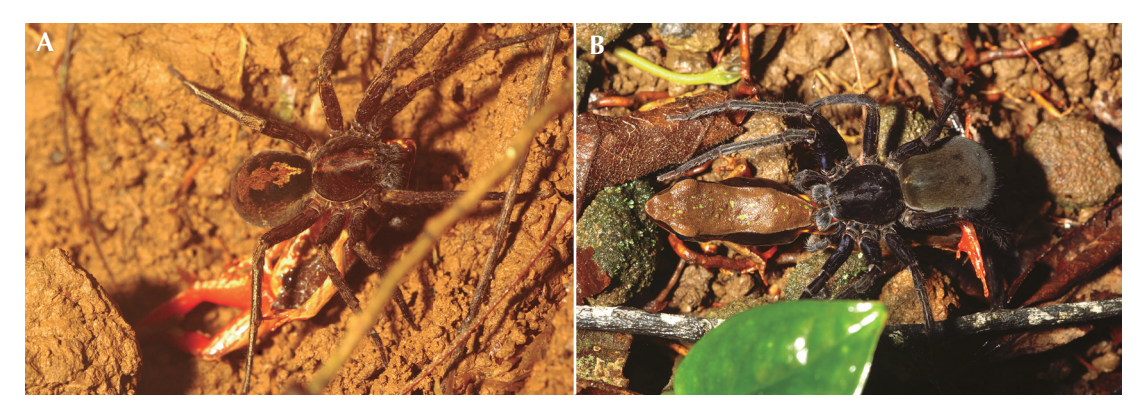
Figure 4. Predation on Lithobates warszewitschii by (A) an adult female Ctenus curvipes at Tirimbina Biological Reserve, and (B) an adult female C. sinuatipes at the Costa Rican Amphibian Research Center.

with its front legs, it immediately rejected the frog, which jumped away unharmed. This field observation is consistent with previous experiments in which C. coccineus attacked and then rejected O. pumilio (Szelistowski 1985, Stynoski et al. 2014, Murray et al. 2016). It is likely that the spiders evaluate dendrobatid chemical cues received during contact and deem them unpalatable (Murray et al. 2016; but see Summers 1999). Although the most frequent predators are wandering spiders of the family Ctenidae, an orb-weaver spider was observed consuming a frog caught in its web. These