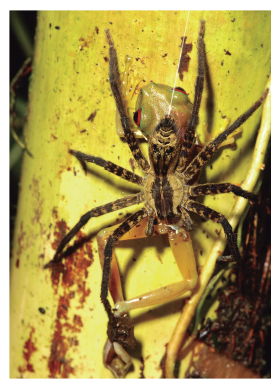
Figure 3. Predation on Duellmanohyla rufioculis by a subadult male Cupiennius coccineus at Rara Avis Rainforest Reserve, Costa Rica. After 4.5 hr, one third of the frog had been consumed.