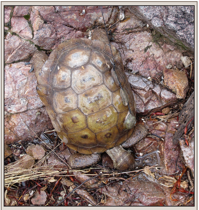
Fig. 2. Adult female Gopherus morafkai using nares to drink from depression on a rock (~ 25 ml) at 1000–1002 h on 4 October 2015.

waterfall, with her head at the base of the waterfall, her nose submerged in a small catchment which held approximately 100 ml of water (Fig. 1). We approached and observed the SDT extract virtually all of the water that collected there from the brief runoff in less than 5 minutes. A second observation of another adult female two weeks later, on the morning of 4 October 2015 following a rainfall event of 3 mm, occurred along a dirt track, just out of the small wash. This female approached a flat rock with a small, centrally located depression that held only 25 ml of water, and successfully "sucked" this water up by positioning her nares in the small puddle while pulsing her throat (Fig. 2).