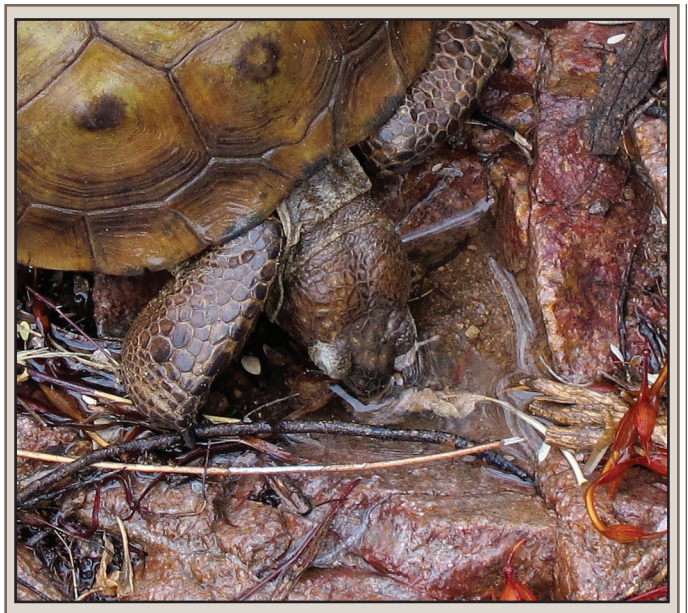
Fig. 1. Adult female Gopherus morafkai drinking small catchment at the base of a rocky waterfall (~ 100 ml) at 0930–0940 h on 22 September 2015.